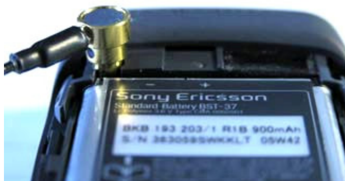
Figure 3 – RF Test Cable

NOTE! Make sure you hear a snap sound to confirm it is properly connected.