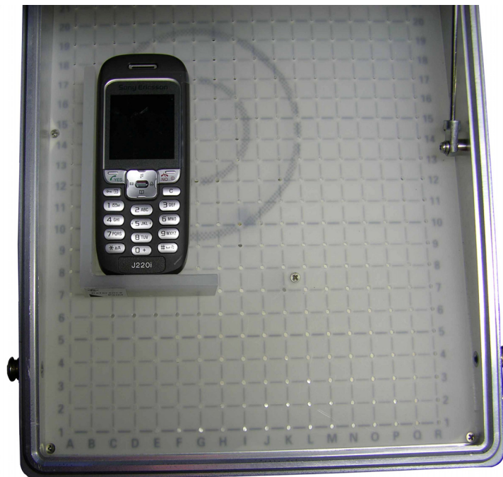
Figure 2 – J220 in Rohde & Schwartz Coupler Box